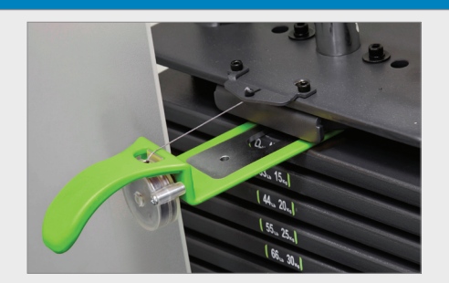
Stacks feature sound dampeners and magnetized selector fork for maximum stability