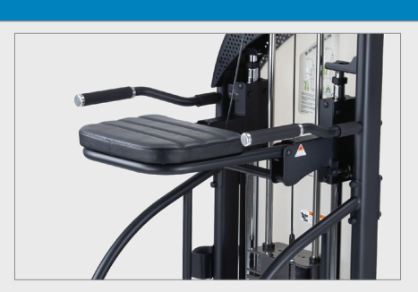
Integrated weight assist platform offsets the users body weight while doing dips or pull-ups, maximizing reps and reducing fatigue

Dual Function Series allows users to work at least 2 major muscle groups per machine maximizing both space and convenience