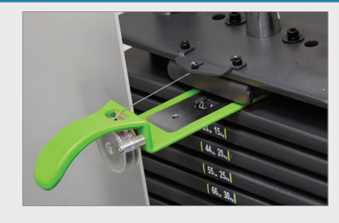
Our stacks feature sound dampeners and magnetized selector fork for maximum stability.