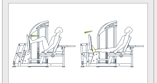
Dual Function Series allows users to work at least 2 major muscle groups per machine maximizing both space and convenience