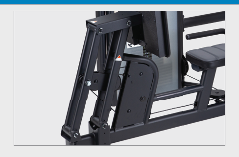
Unique 4-bar linkage system keeps the foot plate at a consistent angle for optimal lower body alignment and proper biomechanics